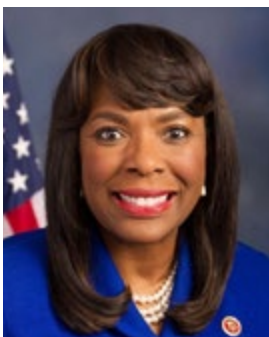
Representative Terri A. Sewell (D-AL)

In October, we hosted a four-part MORPAC Speaker Series Event: 2022 Midterm Elections Preview. We heard insightful updates from the Democratic Senatorial Campaign Committee (DSCC), National Republican Senatorial Committee (NRSC), Democratic Congressional Campaign Committee (DCCC), and National Republican Congressional Committee (NRCC). Each executive director covered targeted key house and senate races across the country and the possible impact these races would have on the 118th Congress.