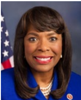
Representative Terri A. Sewell (D-AL)

In October, we hosted a four-part MORPAC Speaker Series Event: 2022 Midterm Elections Preview. We heard insightful updates from the Democratic Senatorial Campaign Committee (DSCC), National Republican Senatorial Committee (NRSC), Democratic Congressional Campaign Committee (DCCC), and National Republican Congressional Committee (NRCC). Each executive director covered targeted key house and senate races across the country and the possible impact these races would have on the 118th Congress.