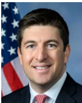
Representative Bryan Steil (R-WI)

Congressman Bryan Steil was elected in 2018 and has earned a reputation for working hard for Wisconsin during his first terms in Congress. He currently serves on the House Financial Services Committee, which oversees all components of the nation's housing and financial services sectors. Congressman Steil is focused on making the American dream achievable for everyone. In 2023, Congressman Steil was appointed Chairman of the Committee on House Administration. He previously served as Ranking Member on the Elections Subcommittee and is focused on ensuring the House is open, secure, and accountable to the American people, and on strengthening Americans trust in our elections.