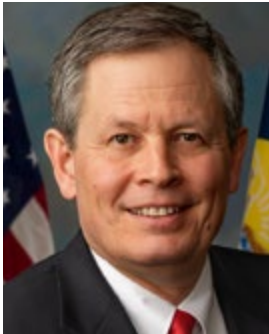
Senator Steve Daines (R-MT)